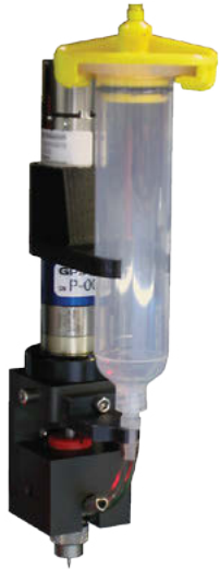
Precision Auger Pump

Upgrade your existing dispense robot with an advanced Precision Auger Pump. The Precision Auger Pump provides excellent dispense control and repeatability and is suitable for a wide range of applications and fluids.