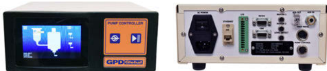
Figure 2: Front and Rear View of Programmable Controller

Pump Parameters available to the operator are acceleration, deceleration, speed, and in the case of dots, an exact amount of rotation. The touch screen interface is intuitive and is programmed for universal recognition with symbols and numbers. The programmable controller can also be connected to a computer for remote programming, making this a comprehensive controller for all Precision Auger pump needs. The operator may set up separate program profiles that can be referenced by inputs from your system. Figure 3 illustrates how an Auger pump integrates into a third party dispensing system.